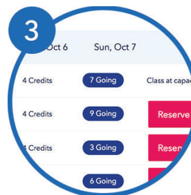
Reserve a Class or use a Day Pass instead!